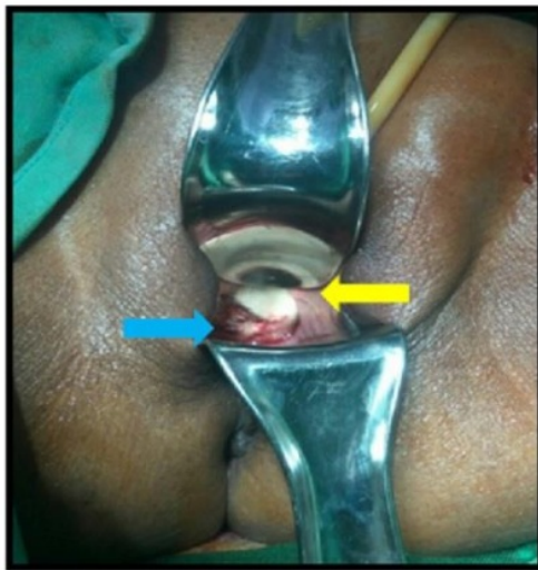
Figure 4. Vaginal examination revealed the existed of yellowish-white stones (marked with yellow arrow) and vesicovaginal fistulas (blue arrow).